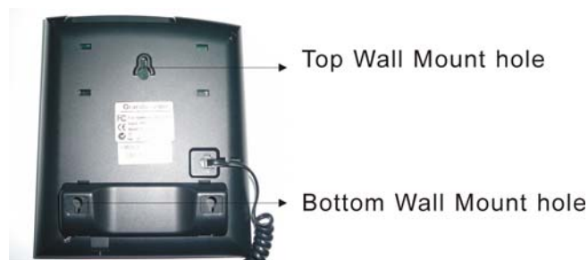
Figure 3: Location of the fixed hanger on GXP280

To use the handset, pull out the tab (extension downward) from the handset cradle, rotate the tab and plug it back into the slot with the extension up to hold the handset.