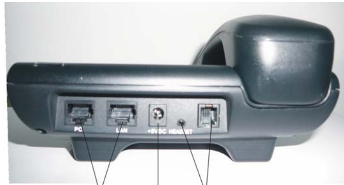
Rj45 Jack Power Jack Headset Jack