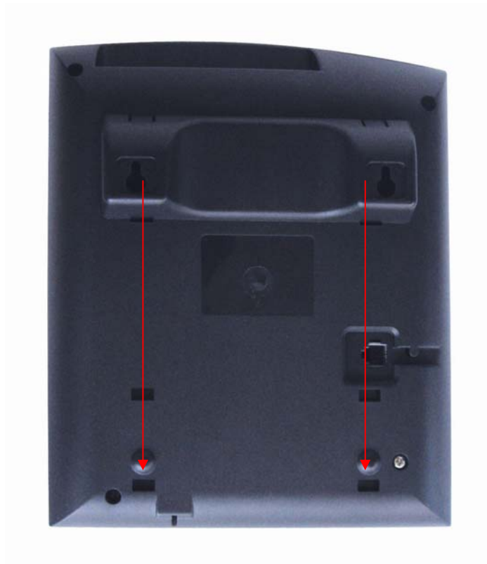
Figure 2: Attach the base stand to the bottom part of the phone to tilt it backwards.

To position the phone on the wall, place a fixed hanger on the wall, hang the back of the phone on the fixed hanger.